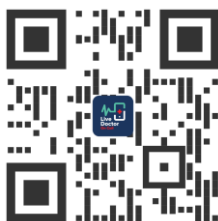
Global Brand Name Pharmacy

Scan these QR Codes below to see our formulary pricing included in the platform