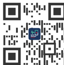
Retail Walk-in Pharmacy